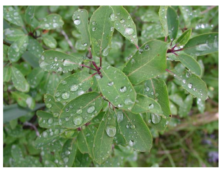
Water droplets on Nemopanthus mucronatus—mountain holly