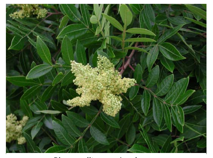
Rhus copallinum—winged sumac

bloomed liberally this spring. The success of this garden, in an area lacking natural bogs, is attributed to its unique design. A log raft covered with peat moss floats in a 300 gallon stock tank. The tank was filled in the spring of 2002 with well water. All subsequent additions came as rain or snow. During last summer's dry spell the raft sank more than six inches below the rim but the plants were happy as they maintained their same position relative to the water level. Early on the bog was not sufficiently acid but the current health of the black spruce, the rhodora, and other bog plants, indicate that bog conditions have now been established. Come and visit our collection. Road signs on Route 20 at Esperance, will direct you to the Arboretum. At the entrance kiosk, a loan copy of a plant locater list is available. Right now the plants are small, perhaps too small for their intended purpose of displaying plants in direct comparison with their close relatives. But plants grow fast and not all of them are too small. Most of our native woody plants do not have showy flowers so there is no rush to get to see them in the early spring. Late summer or fall is a good time for your visit. And in a few years a winter visit to compare bud shapes and leaf scars as you walk the native plant trail on snowshoes should make for a great day. The Landis Arboretum phone number is 518-875-6935. To see a complete list of the plants presently in their collection visit their website at: