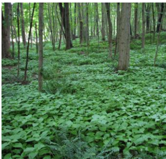
Salvia glutinosa flower, habit, and example of incursion.

In the young forests of southeastern New York, invasive plants are ubiquitous and plentiful, and it is easy to be lulled into the sense that we know all our invasive plants. After all, with garlic mustard, Japanese barberry, Asiatic bittersweet, tree-of-heaven, and many others, what more could possibly compete here? And with relatively high population densities, what are the chances of a truly invasive species going undetected? Imagine my surprise then, when in the fall of 2009 I encountered a plant I did not recognize growing abundantly in the forest understory on lands near the Appalachian Trail in the town of Dover (southeastern Dutchess County). The plant was so prevalent in parts of Duell Hollow as to be dominant and nearly monotypic on the forest floor. Even with a few late flowers, I was unable initially to identify this species using the guide I carried.