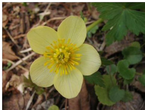
Spreading globeflower ( Trollius laxus ) at Nelson Swamp.