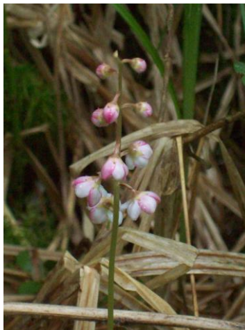
The flowers of pink wintergreen, Fitzgerald Pond.

Right away, after crossing the water filled moat, we were instantly treated to a showy lady's-slipper ( Cypripedium reginae ) and a pink wintergreen ( Pyrola asarifolia ) in flower. Other showy and not so showy (but exciting) finds followed (see the accompanying list).