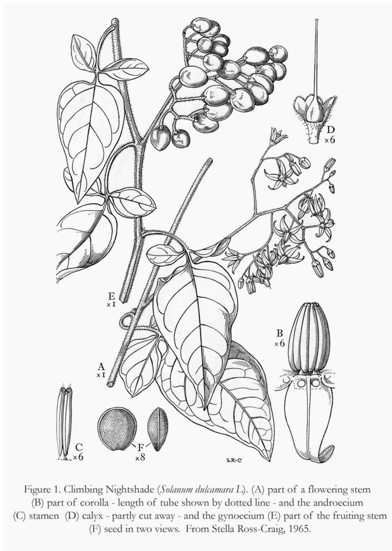
Figure 1. Climbing Nightshade ( Solanum dulcamara L.). (A) part of a flowering stem (B) part of corolla - length of tube shown by dotted line - and the androecium (C) stamen (D) calyx - partly cut away - and the gynoecium (E) part of the fruiting stem (F) seed in two views. From Stella Ross-Craig, 1965.

Dispersal of seed is an important topic when discussing plants. Knowing what species devour the berries gives us an idea of a plant’s range. It is also important to wildlife. Climbing Nightshade seeds are dispersed primarily by birds (see review by Waggy 2009). These birds include ring-tailed pheasant, black-cap chickadee, blackbirds, robins, and starlings. The birds eat the fleshy red berries, digest the pulp, and spread viable seeds.