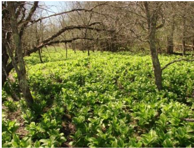
A sea of false hellebore ( Veratrum viride ).