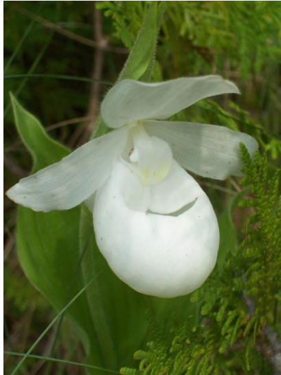
The white showy lady's-slipper at Fitzgerald Pond.

toward the back of the fen, well worth the slog to get there. Who would have thought, since showy lady's-slippers are so, well, showy, that a white lady-slipper would be so striking! But it certainly was.