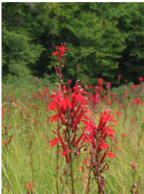
Cardinal Flower, the 2014 NYFA Wildflower of the Year, at Indian Lake in the Adirondacks.

We finished off the day's activities by voting for the 2014 Wildflower of the Year, a tradition that we will have every year to honor and publicize a member of our flora for the next calendar year. This year's win went to cardinal flower ( Lobelia cardinalis ), one of our most spectacular and well-known wildflowers. Many thanks go to the organizers of the field trip and luncheon and to the record number of participants we had for the meeting. It was one to remember.