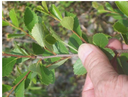
Dwarf Birch at Bonaparte.

After traversing much of the area and eating lunch on the bog mat, we all slowly made our way back up the steep slope and out to the road, after which we had a walk down the railroad tracks at Bonaparte and a quick look into the shrub fen portion to the south of the tracks, where we were able to see much dwarf birch. All in all, the trip was deemed a success despite the heat.